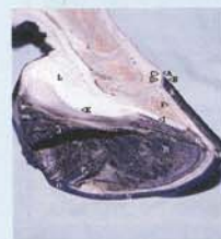
5. PERIOPLIC CORIUM responsible for producing the flexible, thin layer of epidermal horn covering the coronary band (the outer edge of the coronary corium above the hoof wall) and connecting the hoof to the hairy skin above

EW What obvious changes in hoof anatomy/structure are cause for alarm?