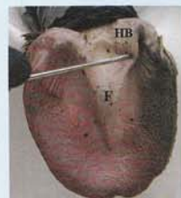
4. FROG/BULB CORIUM responsible for producing the frog and heel bulbs