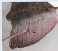
2. LAMINAR CORIUM responsible for producing the epidermal leaves that connect the hoof wall to the horse