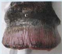
1. CORONARY CORIUM responsible for producing the hoof wall